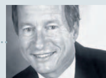
Most conservative Democrat