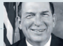
Most liberal Republican