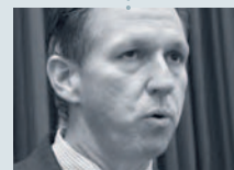
At the center of the House