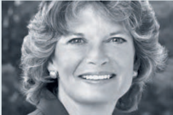
Stevens and Murkowski